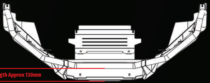
Added Length Approx 130mm