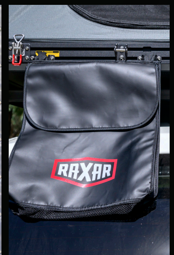
OVERSIZED SHOE BAG