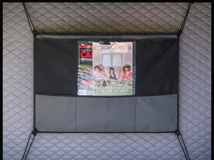
E-Z REACH CEILING ORGANISER