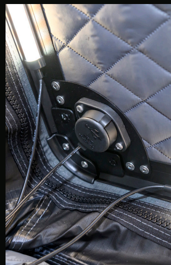
LIGHT SWITCH WITH USB-A & USB-C POWER POINTS