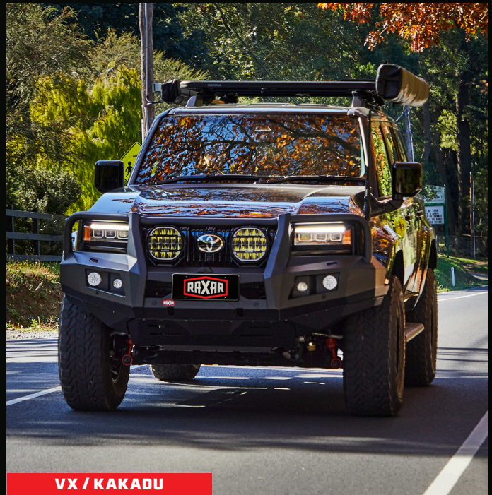
VX / KAKADU

● Approximate added weight to vehicle: 73kg