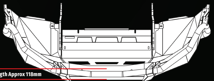
Added Length Approx 118mm